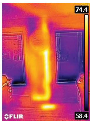
Warm Drain Pipe in Wall