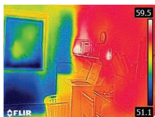
Uninsulated Outside Wall